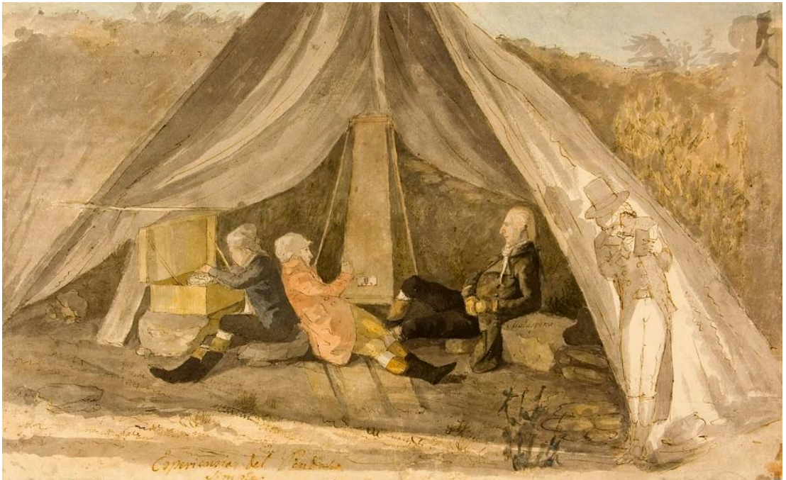
Juan Ravenet, "Experiencia de la gravedad", at Port Egmont, Falkland Islands, January 1794; Museo Naval 1726 (36)

In both hemispheres, and in a variety of different latitudes, many experiments were made relative to the weight of bodies, which will tend to important discoveries connected with the irregular form of our globe; these will also be highly useful, so far as respects a fixed and general measure.<sup>21</sup>